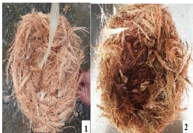
Fig 1: Stages of Pretreatment (1) Effluent Fed through the Coir Mesh (2) Bigger Sized Particles Collected in Coir Mesh

Aerobic and anaerobic treatment is the most common biological method used in treating rubber wastewater as it is an inexpensive treatment method with high efficiency. The system consists of improved anaerobic processes. Coconut fibre as a new medium was selected for rubber wastes treatment. The rubber wash water contains many solid substrates. These particles should be removed before feeding to the plant. Therefore, the wash water is fed through a coir mesh (coconut fibre) where the bigger sized particles are filtered out. It is termed as pre-treatment process.