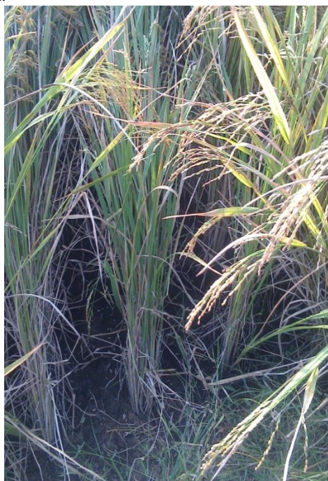
Fig. 3 Plant Height of SRI Rice with Organic Manure

Thus it was observed that the vermicompost contains nutrient content to such an extent that enhances the growth of Rice at a faster rate in comparison to Chemical Fertilizer. Unlike other composts, vermicompost also contains worm mucus which helps prevent nutrients from washing away, holds moisture better and thus helps in increased plant growth.