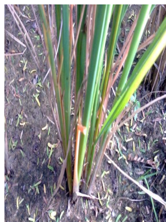
Fig. 6 Tillers of SRI Rice with Chemical Fertilizer