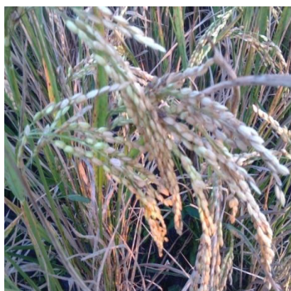
Fig. 7 Growth of Panicle in SRI Rice with organic Manure