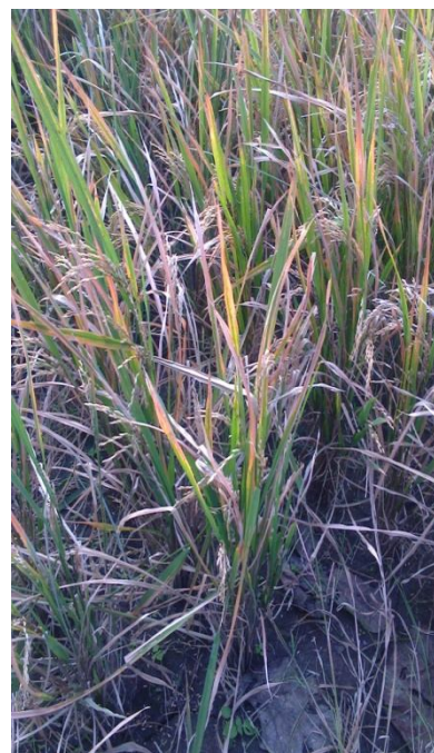
Fig. 4 Plant Height of SRI Rice with Chemical Fertilizer