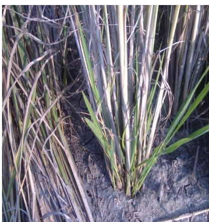
Fig. 5 Tillers of SRI Rice with Organic Manure