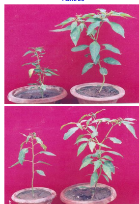
Plate 2.5 Effect of Boerhaavia diffusa (BD)/ Clerodendrum aculeatum (CA) phytoprotein with bioenhancer milk protein (MP)/papain (P) on disease incidence in Capsicum annum a. Untreated control plant showing severe viral disease symptoms (left) and Treated plants (BD+MP) showing better growth and no disease symptoms (right) b. Untreated control plant showing severe viral disease symptoms (left) and Treated plants (CA + P) showing better growth and flowering no disease symptoms (right)