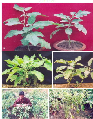
Plate 2.4 Effect of Boerhaavia diffusa (BD)/ Clerodendrum aculeatum (CA) phytoprotein with bioenhancer milk protein (MP)/papain (P) on yield and disease incidence in Solanum melongena a. BD with MP treated plant showing better growth and flowering (left) and untreated control plant showing poor growth and feebly perceptible viral infection (right) b. CA with P treated plant showing better growth and fruiting (in micro plot) c. Untreated control plant (for CA) showing viral infection (in micro plot) d. CA with MP treated plant showing high fruit setting (in macro plot) e. Untreated infected plant showing less fruit setting (in macro plot)