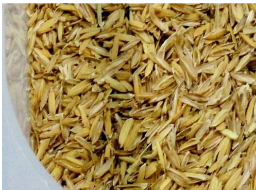
Fig.1: Rice Husk

RHA has a good pozzolanic property. It is non – plastic in nature. RHA was collected from local rice mill. It physical properties are shown in the following Table 2. However the chemical characteristics of the aforementioned RHA have not done but it is mostly comprised by SiO 2 , Fe 2 O 3 and Al 2 O 3 as mentioned in various literatures.