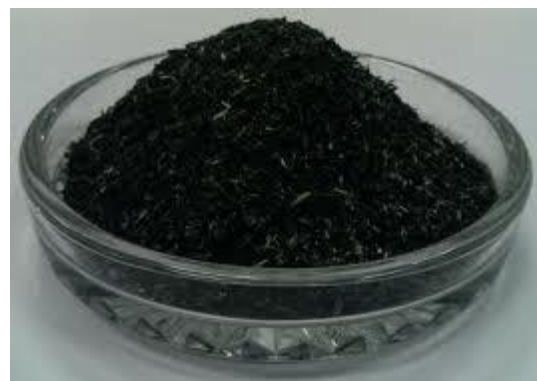
Fig.2: Rice Husk Ash