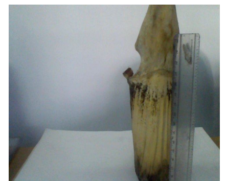
Figure:3, Culm-sheaths of Bambusa garuchokua Barooah et Borthakur Measuring 13 cm. Long and 22 cm. broad

(An ISO 3297: 2007 Certified Organization) Vol. 4, Issue 6, June 2015