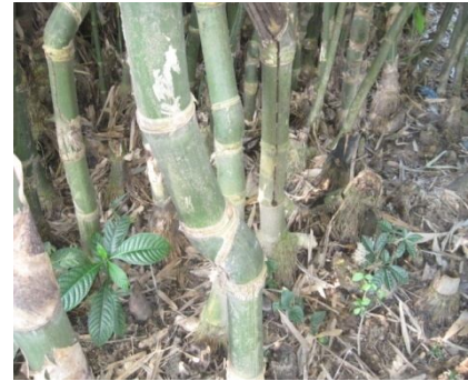
Figure:1, A view of Bamboosa garuchakoa

Out of 50 sample measured the length measurement was ranges from 55 to 70 in ocular scale, accordingly the calibrated measurement of the sample is ranges from 1.8920mm to 2.4080mm. The mean value of the calibrated measurement of the fibre length of the bamboo is 2.1500mm.