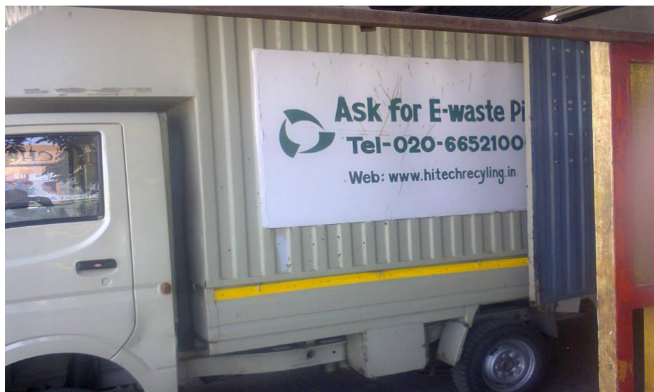
Fig.1. E-waste collection van by formal recycler

These three E-waste recycling centers are working as per MPCB guidelines. While the MPCB has permitted Eco-credible to recycle 2000 Tons per year, the company has been able to recycle only 150 Tons wastes this year, because of E-waste availability is insufficient manner. Since most electronic and electrical products have a value at the end of their useful life, the informal sector is able to pay the consumer to acquire this waste. The formal sector, because of its larger infrastructure and operational costs, finds it hard to compete with the informal sector.