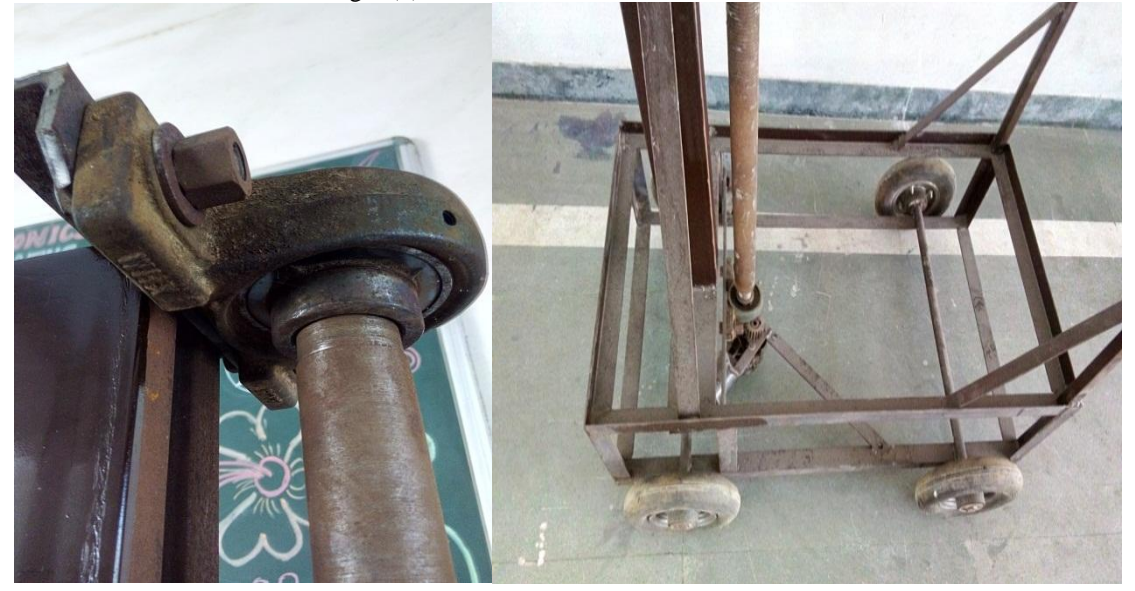
Fig.2 Design specifications (a) Journal bearing (b) Mechanical base

Base, as the name implies it is the base setup upon which all whole mechanical setup is kept. The base has a gap of rectangular shaped which is used to keep the battery, Lead screw and the electrical components. Size of the base setup is 120 cm x 80 cm x 50 cm which is shown inFig 2 (b).