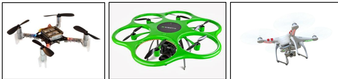
Fig. 1 – Sample snapshot of Micro and Mini UAVs [3] – [5]

These devices are safe, easy to use and carry anywhere. Alongside, cost is one of the biggest benefits of drones as they are relatively cheaper than traditional helicopters and can provide better results for a fraction of the cost for surveying new areas for mining companies. And eventually they are going to reshape the future of mining operations.