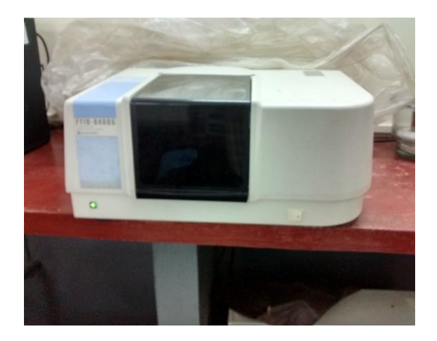
Fig 1: FTIR Spectrophotometer

FTIR spectrophotometer (Fig 1) was used to characterize the SC600^{\circ}C . First the sample was prepared by mixing the sample and KBr (10:1 ratio) in a mortar and a thin transparent pellet was then made by applying hydrostatic pressure using the lever manually. TheFTIR was then openedand the sample pellet was then kept on the mount for the analysis. The plotbetween Transmittance v/s Wavelength was obtained was then interpreted. The various steps mentioned above have been depicted in Fig 2.