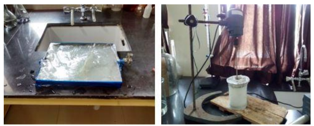
Fig 3: a) Thin film bubbling reactor b) Continuously stirred slurry reactor

ZnO was used to remove the H_2S present in the exhaust gas since H_2S reacts with ZnO to produce ZnS and H_2O . Two different types of reactors were used to check the removal of H_2S namely; a) Thin film bubbling reactor b) Continuously stirred slurry reactor, shown in Fig 3a) and 3b) respectively. Fig 3 also shows the reaction happening between ZnO and H_2S present in the exhaust.