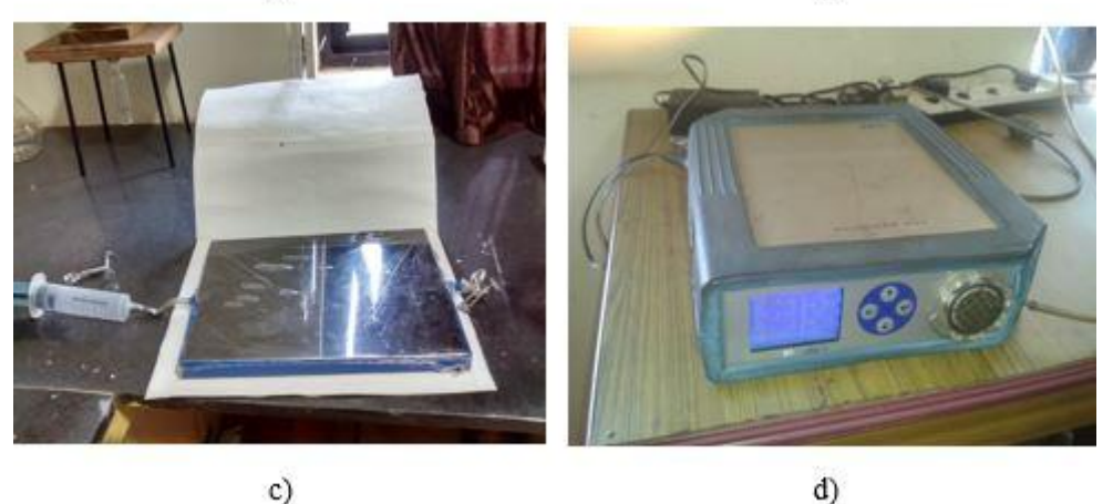
Fig 5: Steps involved in CO<sub>2</sub>sequestration: a) CO<sub>2</sub> adsorption thin film reactor; b) Injection of vehicular exhaust c) Sample collection after adsorption; d) Gas Analyser

The above figure (Fig 5) also clearly shows the thin film reactor that was used for the sequestration, the bellow in which the gas was collected and the Gas Analyser used to check the composition of the unadsorbed gas.