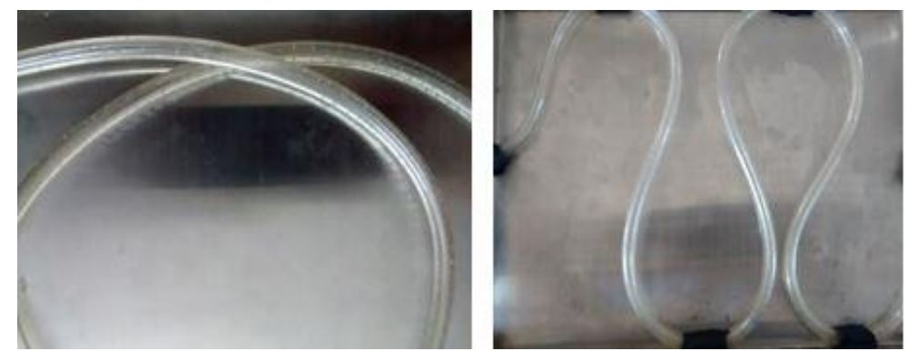
Fig 4: a) Porous tube used in the reactor b) Thin film bubbling reactor without the reactants

ZnO was used to remove the H_2S present in the exhaust gas since H_2S reacts with ZnO to produce ZnS and H_2O . Two different types of reactors were used to check the removal of H_2S namely; a) Thin film bubbling reactor b) Continuously stirred slurry reactor, shown in Fig 3a) and 3b) respectively. Fig 3 also shows the reaction happening between ZnO and H_2S present in the exhaust.