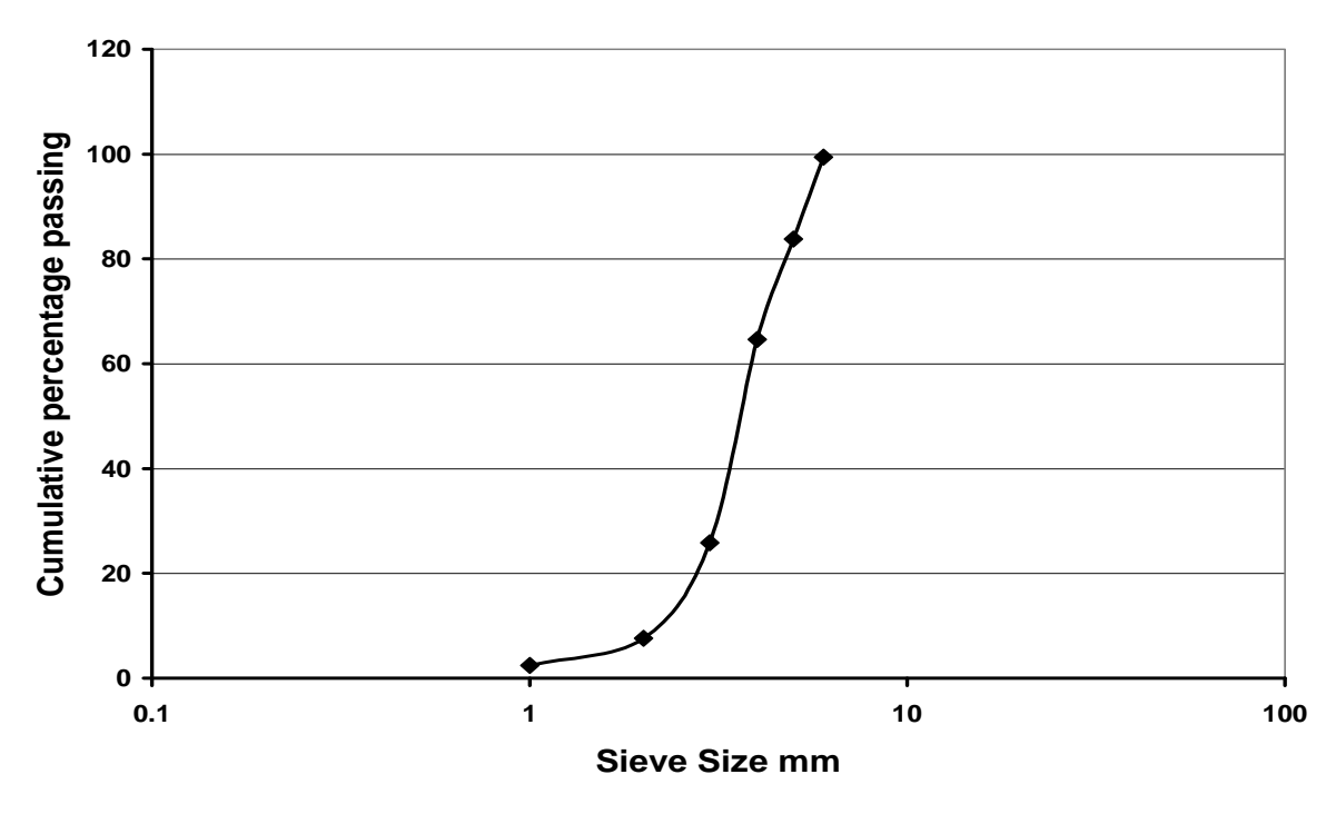
Fig 3.1 Particle size distribution