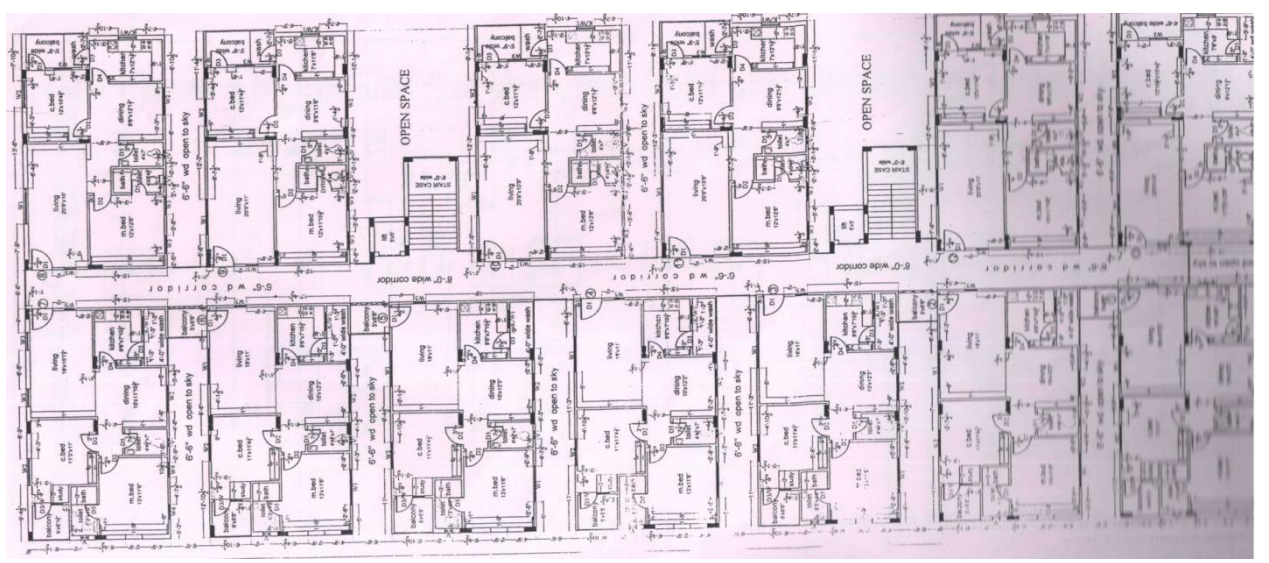
Typical floor of working plan Fig.3

In the present study G+4 building at Anantapur, gooty road, India is designed (Slabs, Beams, Columns and Footings) using Auto CAD software. The loads are calculated namely the dead loads which depend on the unit weight of the materials used (concrete, brick) and the live loads using the code IS:456-2000 and HYSD BARS FE415 as per IS:1786-1985. The safety of G+4 reinforced concrete building will depend upon the initial architectural and structural configuration of the total building, the quality of the structural analysis, design and reinforcement detailing of the building frame to achieve stability of elements and their ductile performance. Proper quality of construction and stability of the infill walls and partitions are additional safety requirements of the structure as a whole. The detailed plan of the building is given in Fig.3