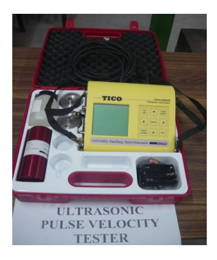
Fig 2 ultrasonic pulse velocity test

are the longitudinal waves, which are converted into an electrical signal by a second transducer [14-15]. Electronic timing circuits enable the transit time T of the pulse to be measured. The equipment consists essentially of an electrical pulse generator, a pair of transducers, an amplifier and an electronic timing device for measuring the time interval between the initiation of a pulse generated at the transmitting transducer and its arrival at the receiving transducer.