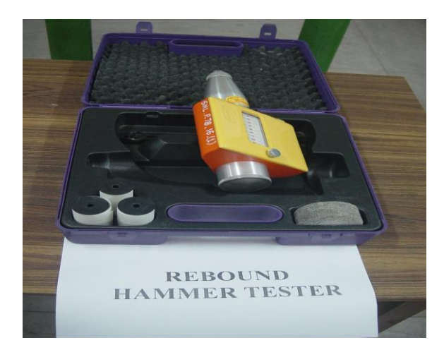
Fig 1 Rebound Hammer Test

The mass hits the shoulder of the plunger rod and rebounds because the rod is pushed hard against the concrete. During rebound the slide indicator travels with the hammer mass and stops at the maximum distance the mass reaches after rebounding. A button on the side of the body is pushed to lock the plunger into the retracted position and the rebound number is read from a scale on the body [13].