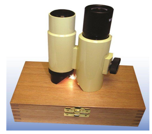
Fig 4 Crack detection microscope

working conditions. The image is focused by turning the knob at the side of the microscope and the eye-piece can be rotated through 3600 to align with the direction of the crack under examination. The 4 mm range of measurement has a lower scale divided into 0.2 mm divisions. These 0.2 mm divisions are sub-divided into 0.2 mm divisions.