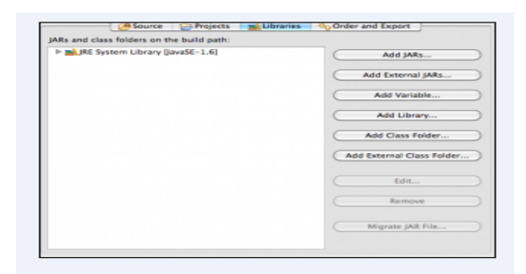
FIG1: Adding Jar files to Parser

Figures show the results of word alignment from a sentence and PoS tagging by using HMM model with vitebri algorithm.