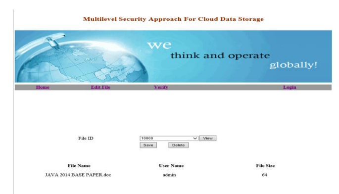
Fig. 5. Cloud Log Management

The cloud disk utilization is more important to improve the cloud server performance. The replication of file storage is wastage of disk space. The disk space wastage is to minimize by using the file key technique. At the time of file upload the data owner using file key to store the file in the data base. The same file key and same file name are repeated in the time of uploading the server generate the error message and stop the process. The user status is recorded in log file. The log files are maintained by the Third Party Auditor. The log admin to maintain the log is very important to avoid malicious activity in the cloud storage. The un-authorized user try to enter and access the original file the log report is send to the data owner. The file size, file name and user name is status is periodically monitor in cloud log server is shown in Fig. 5.