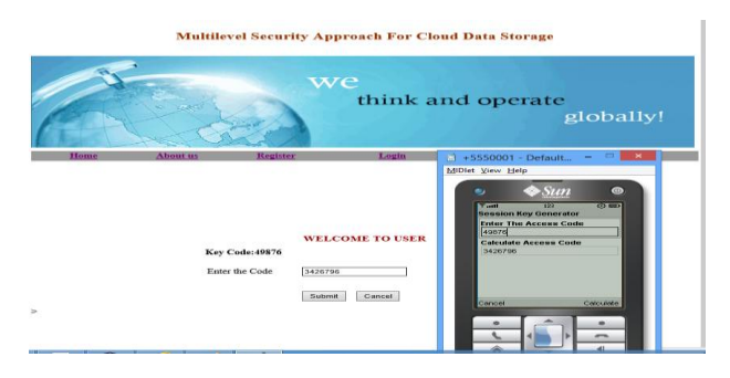
Fig. 4. Session Key Generator

The session key management module is implemented with the help of J2ME mobile application environment. The user will login using username and password. The username and passwords are matched in database the random virtual key is automatically generated for each user. The random virtual key is entering into the mobile application and click to calculate button to create the session key for the user session is shown in the Fig. 4.