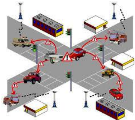
Figure I: VANET infrastructure

Everyvehicle in the road acts as a wireless router or node, and allowing vehicles approximately 100 to 300 meters of each other to connect, in turn, to create a network with a wide range. Each RSU is responsible for maintaining the vehicles for that particular distance on the road side.Intelligent vehicular ad hoc networks (In VANETs) use Wi-Fi IEEE 802.11p (WAVE standard) and WiMAX IEEE 802.16 effective communication between vehicles in the road side infrastructure with dynamic mobility.