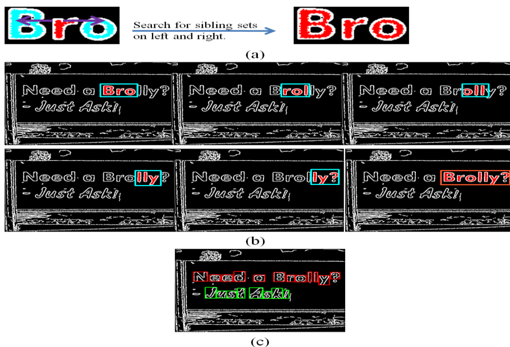
Fig. 2. The adjacent text grouping method in natural scene image.

The text information usually appears in text strings composed of several character members in similar sizes rather than single character, and text strings are normally in approximately horizontal alignment. The adjacent character grouping method calculates the sibling groups of each character candidate as string segments and then merges the intersecting sibling groups into text string. To model the boundary size and location of a text string, a bounding box is assigned to each boundary in a color layer.