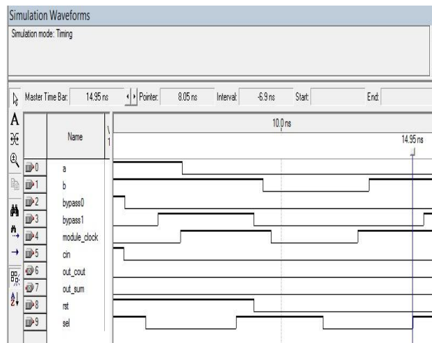
Fig 3: Simulation Waveforms

The Simulation Output without fault is observed as '0' for out_sum and out_cout for the given inputs on the, b, c in , sel, rst pin the output is processed from the flip flops, full adder and multiplexer.