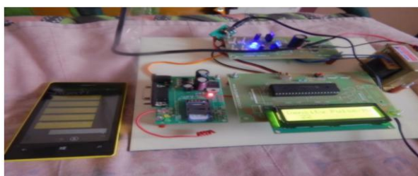
Figure 4.1 Heart Rate Monitoring Kit