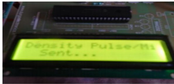
Figure 4.2 LCD Display