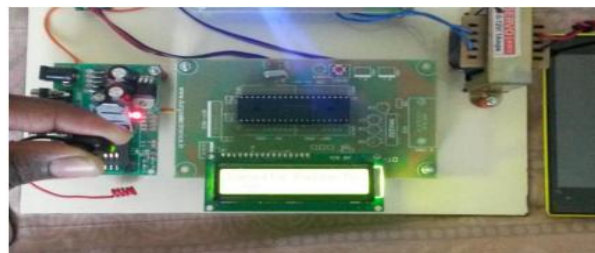
Figure 4.3 Blood Volume Display