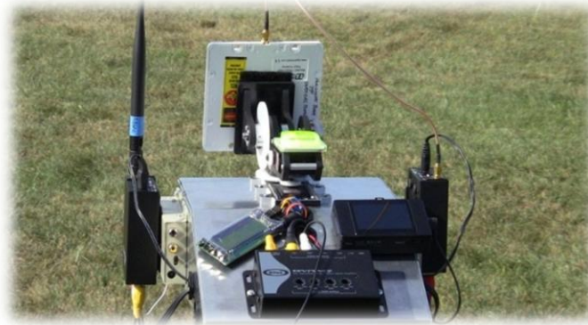
Fig 2: Control Station