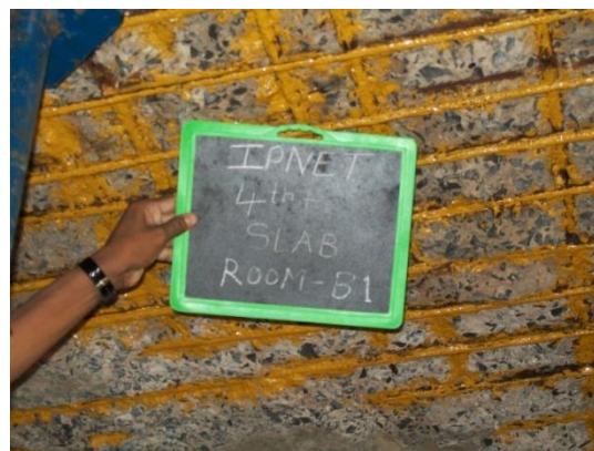
Fig.1. Application of IPNet-RB

Application of primer shall be followed with application of two coats of IPNet-RB (confirming to CBRI requirement) anticorrosive epoxy coating for bar protection against future corrosion. Coating is for old as well as newly provided steel. This system (Interpenetrating polymer network system for rebar: IPNet-RB) once applied on the steel shall provide extended protection against future carbonation and chloride attack.