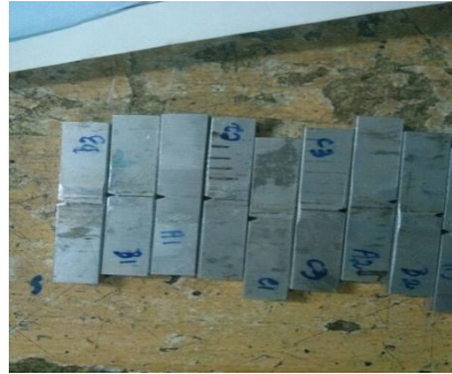
(a)specimen before testing

Department of Mechanical Engineering, Magna College of Engineering, Chennai-600055, India.