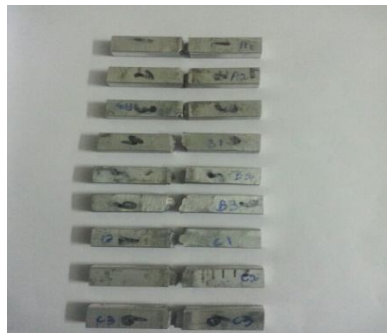
(b) specimen after testing