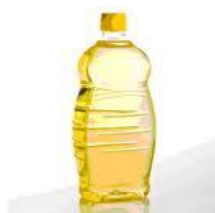
Fig: 2.2 Rice bran oil