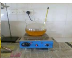
Heating of oil