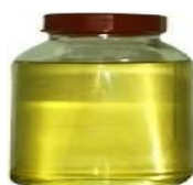
Fig: 2.1 Cotton seed oil

RICE BRAN: Rice is a grain belonging to the grass family. It is related to other plants such as wheat, oats and barley which produce grain for food and are known as cereals. Rice refers to two species ( Oryza sativa and Oryza glaberrima ) of grass, native to tropical and subtropical south-eastern Asia and to Africa, which together provide more than one-fifth of the calories consumed by humans. The plant, which needs both warmth and moisture to grow, measures 2-6 feet tall and as long. Flat, pointy leaves and stalk-bearing flowers which produce the grain known as rice. Rice is rich in genetic diversity, with thousands of varieties grown throughout the world.