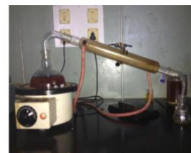
Methanol recovery from bio-diesel