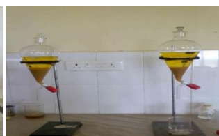
Separation of bio diesel