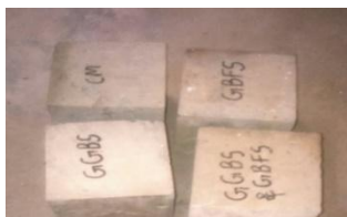
Fig 1 Specimens before Acid Test