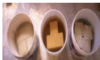
Fig 2 Specimens Immersed in Sulphuric Acid