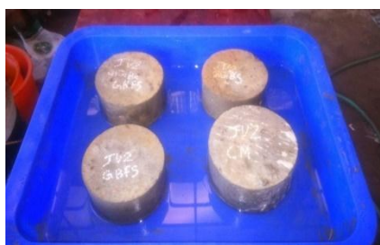
Fig 1 Lab Sorptivity Method

Sorptivity test was done based on ASTM C 1585 (2004). Sorptivity is done to measure the capillary absorption of water. Initially the specimens were oven dried for 24hrs at 100°C and after that the specimens are allowed to cool. Initial weight of the specimens are noted. Then the specimens are placed in a tray filled with water at a height not more than 5mm from the base of the specimen. Figure 1 shows the Lab Sorptivity Method. The specimen's weight was noted at intervals of 0, 5, 10, 20, 30, 60, 120, 180, 240, and 300 minutes, after wiping off any excess water. The quantity of absorbed water during each interval was then determined using Eqn. 2.