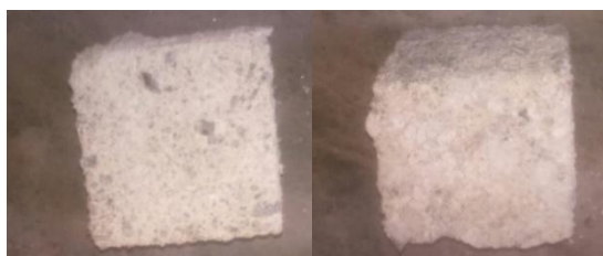
Fig 5 GBFS Specimen Fig 6 GGBFS + GBFS Specimen

Figures 3,4,5 and 6 represents control specimen, GGBFS specimen, GBFS specimen and GGBFS + GBFS specimen after acid test. White filmy substance can be seen on its surfaces.