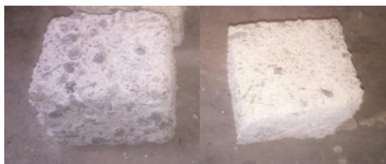
Fig 3 Control Specimen Fig 4 GGBFS Specimen