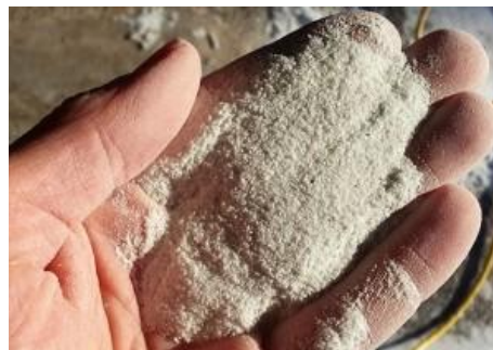
Fig. 3: Plaster sand