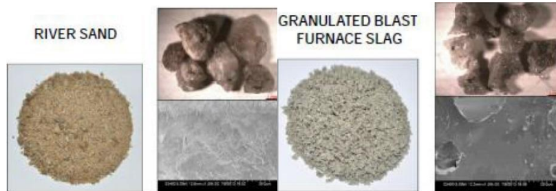
Fig. 1: Natural River Sand Fig. 2: Raw Granulated Blast Furnace Slag