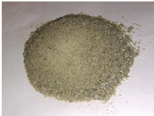
Fig. 6: Processed Granulated Blast Furnace Slag