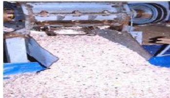
Fig-2 Waste plastics cut to required size

Modification of plastic aggregate was done by heat treatment at a temperature between 160°C to 200°C in Plastic Granule Recycling Machine (PGRM). Then aggregate was cooled at room temperature by removing it from the machine.