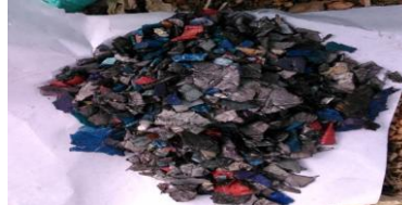
Fig-1 Mixture of collected waste plastics

Modification of plastic aggregate was done by heat treatment at a temperature between 160°C to 200°C in Plastic Granule Recycling Machine (PGRM). Then aggregate was cooled at room temperature by removing it from the machine.