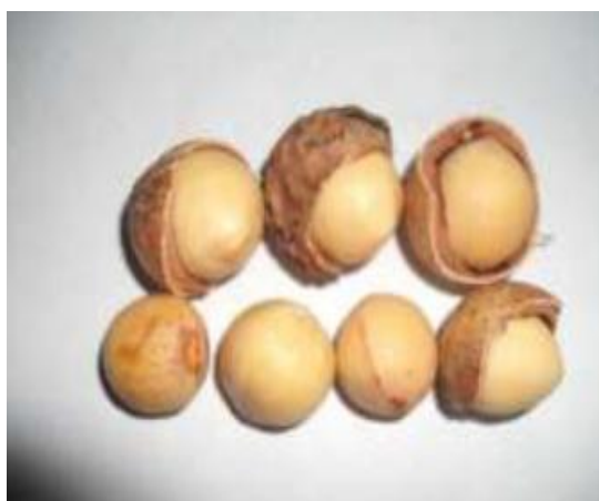
Fig-2: Tamanu seed's shell and kernel