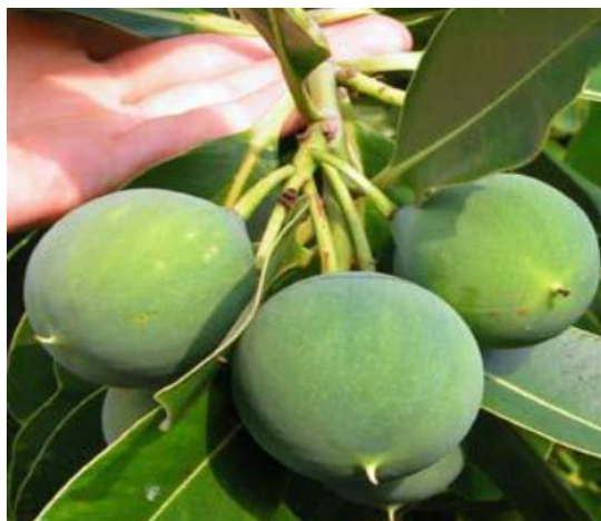
Fig-1: Tamanu fruits