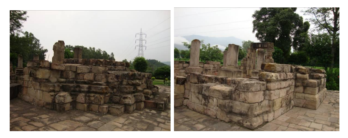
Fig (A): General view of Kala Dera temple-I Fig (B): Lateral view of Kala Dera temple-I

The microbial metabolites of bio-films are responsible for the deterioration of the underlying substratum and may lead to physical weakening and discoloration of sandstone [2]. The condition of the monuments depend on use of them, also plays a vital role, which deteriorate the monuments. The development of specific species on a particular stone surface is determined by the nature and properties of the stone. The response of living organism to a potentially colonizable surface depends on ecological species involved [3].