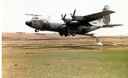
RAF C-130 airdropping food during 1985 famine