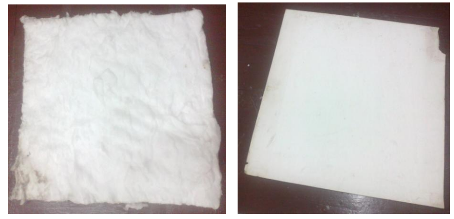
Fig.1.Ceramic Fiber and Silicon Fiber Sheet (Ceramic foam) dielectric materials respectively from left to right.