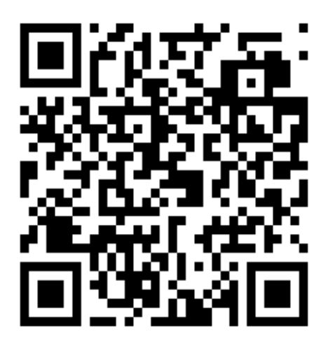
Fig(2). QR Code

ISO standard, market proven and completely measurable. QR codes allows average person to decode the QR code by scanning and read by a camera-equipped Smartphone when you've downloaded a scanner app [3].