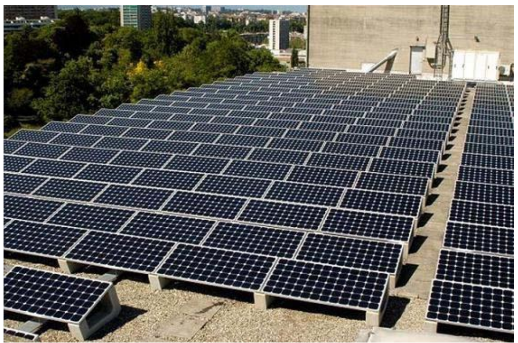
Figure 4: The rack design accepted for energy optimization

15. Rack Design: Effective approach towards Green cloud is accomplished using solar energy and organizing the panels as below:-