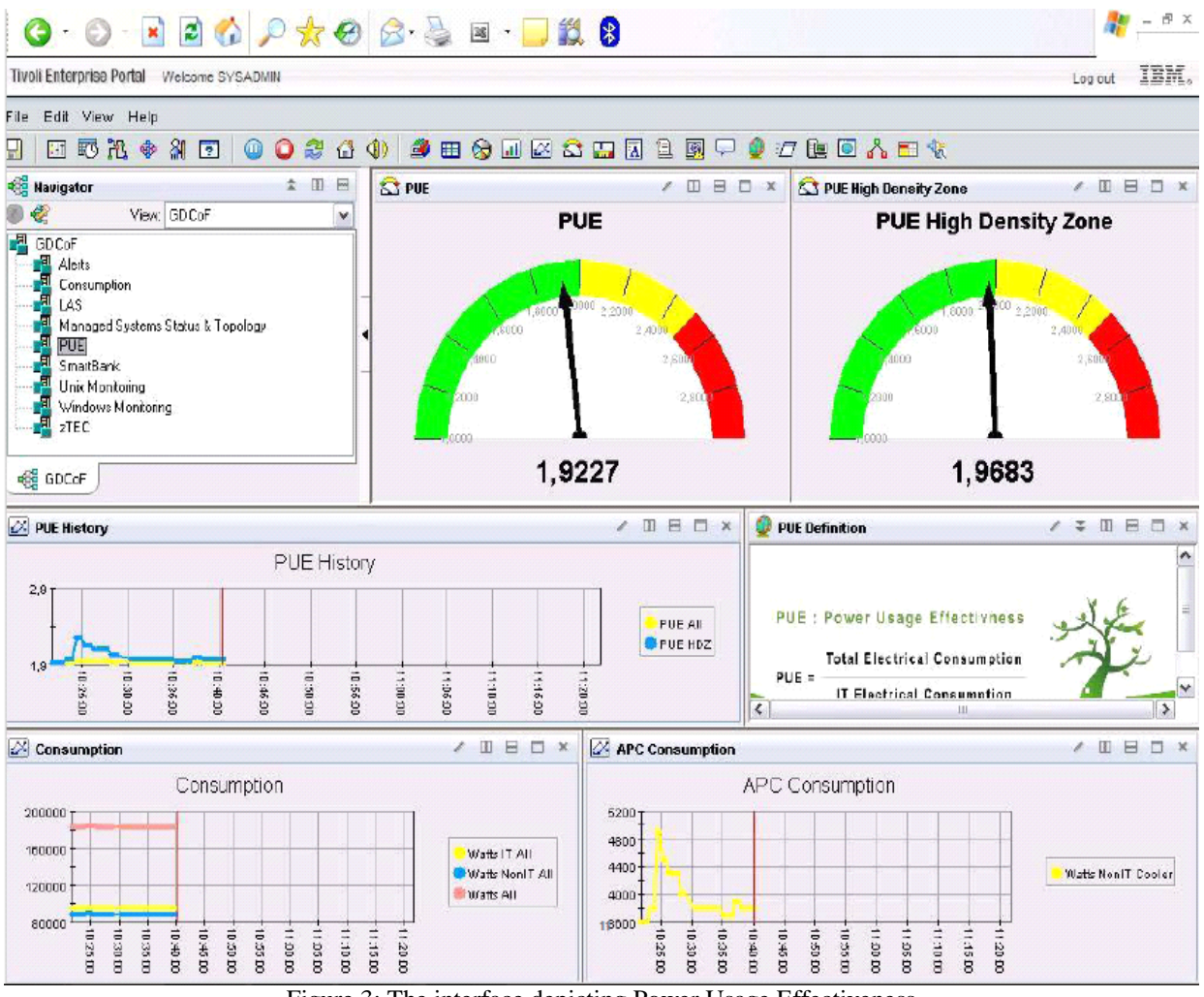
Figure 3: The interface depicting Power Usage Effectiveness