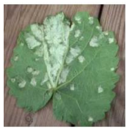
Fig. 4 Powdery mildew

In order to control this spray with fungicides like Bordeaux mixture (1%), Copper Oxychloride (0.2%), Mancozeb (0.2%), Metalaxyl (0.2%) or Fosetyl Al (0.2%) should apply.