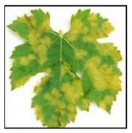
Fig.3 Downy mildew

Message: Disease found is downy mildew caused due to low temp. range: 11^{\circ}\text{C} - 26^{\circ}\text{C}