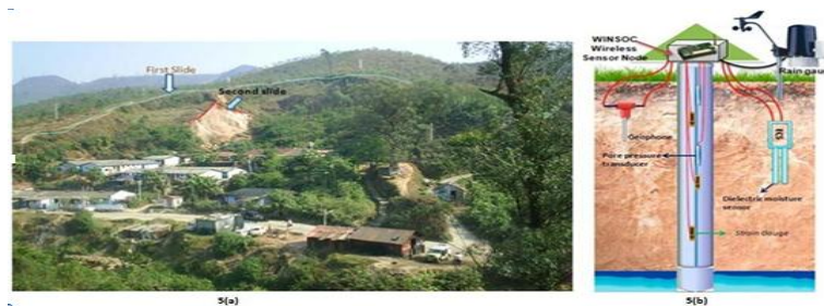
Figure::3 System Setup

wireless sensor network in real landslide scenarios. As a result, the Government has requested us to expand the wireless sensor network installation to another 12 mountainous locations in three major regions all over India: Ker-ala State, the North Eastern region, and the Himalayan region.