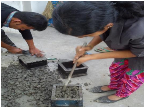
Figure 1: Casting of Specimens

The concrete cubes, cylinders and beams were cast in moulds in such a way as to produce full compaction of concrete with neither segregation nor excessive laitance. The concrete is filled into the mould in three layers approximately 5cm deep. Each layer was well compacted. After the compaction, the top surface is finished level with the top of the mould using a trowel. The standard tamping rod was used and the strokes of the rod were distributed in a uniform manner over entire mould. The number of stokers per layer required to produce the specified conditions, vary according to the type of concrete.