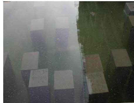
Figure 2: Curing of Specimens