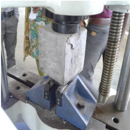
Figure3. Compression Test