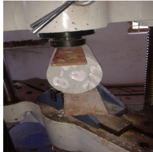
Figure4. Split Tensile Strength Test