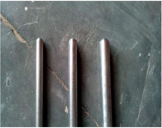
Fig.1. Tools used to conduct the experiment and deform the sheet

4. Experimental setup: The process starts from a flat sheet blank clamped on a fixture and mounted on the table of CNC machine. Then the forming is done with help of hemispherical tool shown in figure 1 to move over the surface of plate Hemispherical type forming tool with 8mm, 10mm and 12mm diameters were used as shown in figure 1. Also fixture with clamping system was designed and machined according to desirable dimensions shown in figure 2.