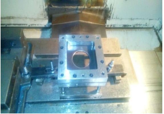
Fig.2. Fixture designed to hold the plate