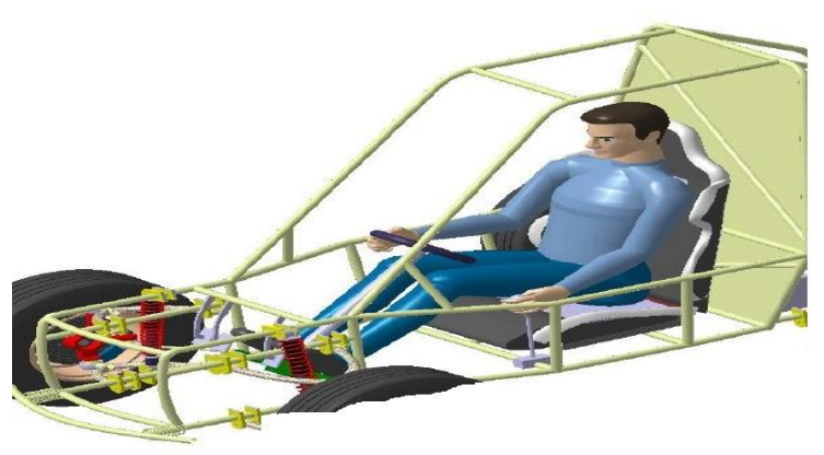
Fig: Proposed model showing free leg room area