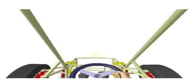
Fig: Ideal front visibility of the driver