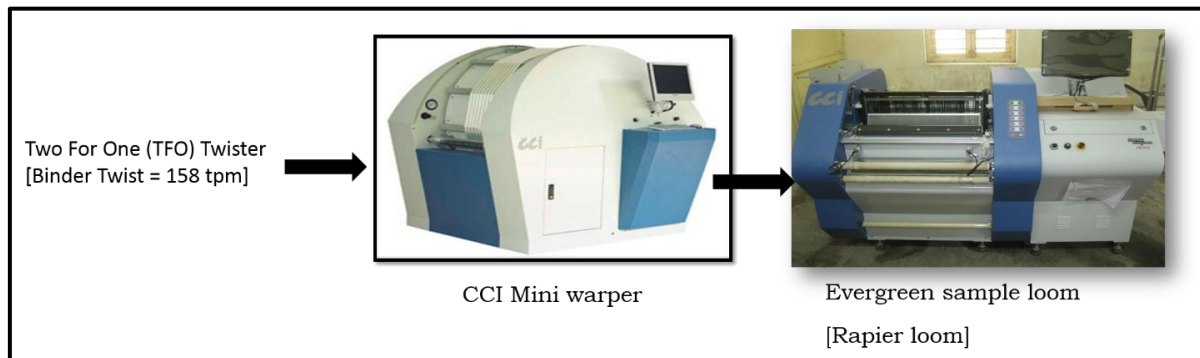
Fig 1. Miniature Rapier Loom Line

Fabric weave count value was kept same as Nylon 6, 6 standards, for getting valid ground for comparison [3, 4]. Woven fabric quality parameters were measured as per standard test methods and compared with MERCEDEZ BENZ standards true for equivalent size Nylon 6, 6 air bag fabric.