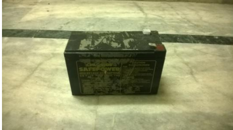
Figure 5:- Battery used for wireless bot

• Secondary batteries can be recharged; that is, they can have their chemical reactions reversed by supplying electrical energy to the cell, approximately restoring their original composition. Lead-Acid batteries and Lithium batteries fall into the secondary battery's category.