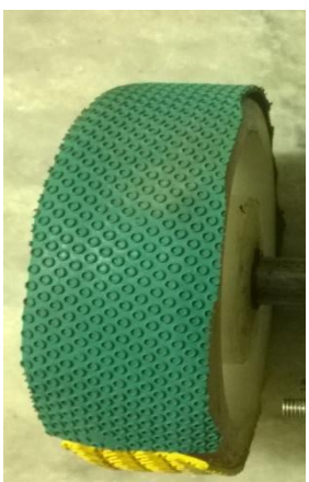
Figure 4 :- Nylon wheel with grips

A wheel is a circular component that is intended to rotate on an axle bearing. The wheel is one of the main components of the wheel and axle. Wheels of different materials like plastic, nylon and of different sizes can be used. Wheels of different dimensions can also be used like 4 inch wheel, 5 inch wheel etc. We have used 4 inch wheels for our robot.