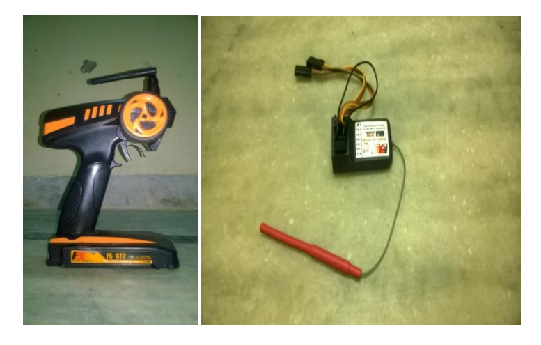
(a) (b) Figure 2 :- (a) Transmitter ), (b) receiver