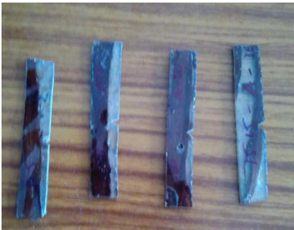
Fig.3 Burmese Silk Orchid fiber composite impact specimen

Fig.3 and Fig.4 shows the Impact specimens of Burmese Silk Orchid fiber and Rose Madder fiber composites respectively