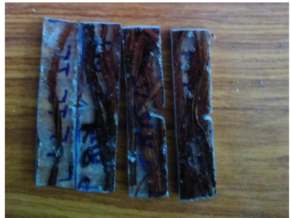
Fig.4 Rose Madder composite impact specimen

Table III and Table IV show the Impact testing values of Rose Madder and Burmese Silk Orchid fibers reinforced epoxy matrix composites respectively.