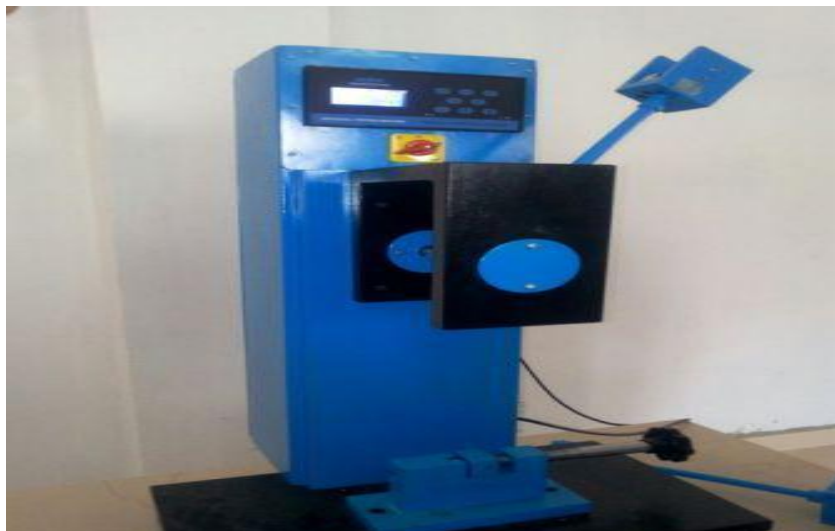
Fig.2 IZOD Impact Tester