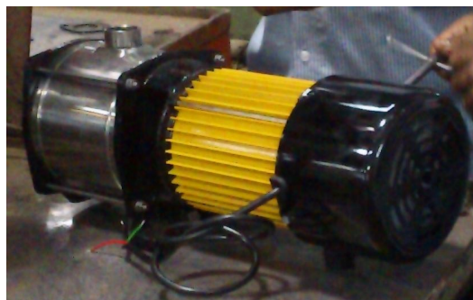
Fig. 1: Monoblock SWJ - 1 HP

The product is Monoblock shallow well jet (SWJ) pump single phase - 1 HP. This paper deals with the assembly process of the whole pump. It is mainly of two divisions namely motor assembly and pump assembly lines. There are totally 8 stages in the main assembly line and followed by a testing process and then the pump is packed and dispatched. The stator is brought to the main assembly line and the assembly is carried over it. The main parts are assembled in the sub assembly section and it is assembled to the rotor in the main section. Finally after 8 stages the pump is assembled and it is taken to the testing stage where it is tested and if it is to the required parameters it is dispatched to the next section. The pump dealt in the paper is shown in Fig 1.