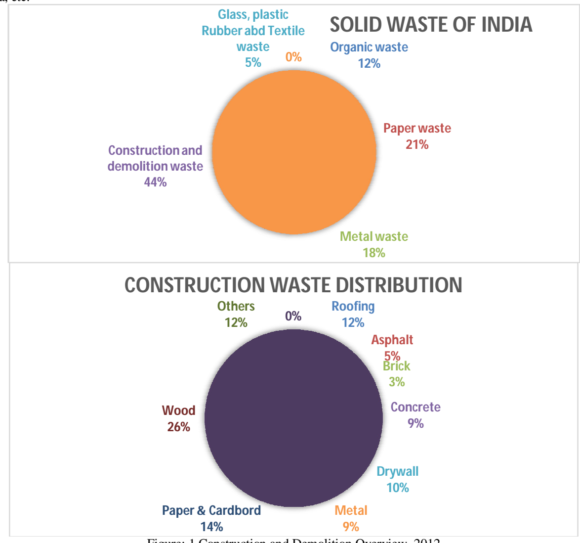
Figure: 1 Construction and Demolition Overview, 2012

The cost of construction materials is increasing enormously. In India, the cost of cement during 1995 was Rs. 125/kg and in 2015 the price increased to Rs. 280/bag. In case of bricks the price was Rs. 0.66 per brick in 1995 and the present rate is Rs. 5 per brick in 2015. With the environmental hazards caused by excessive and illegal extraction of river sand, the mining of river sand is banned since April 1, 2012. The raw materials used in construction are largely non-renewable natural resources hence meticulous use of these materials is essential. The demand for aggregates in 2007 has seen an increase by five percent, to over 21 billion tones, the largest being in developing countries like China, India, etc. <sup>[2]</sup>