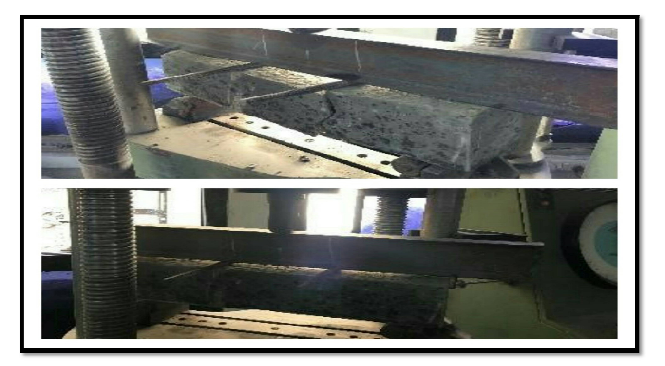
Figure :4 Flexural bending strength of beams

The size of beam is 700*150*150 mm and 28 day flexural strength beam. Normally concrete is not used to take tensile stresses because its strength is tension is appreciably less than the strength in compression. In flexure, this strength is soon exceeded well below working loads, the concrete cracks and the tensile stresses have than to be fully taken up by steel reinforcement.