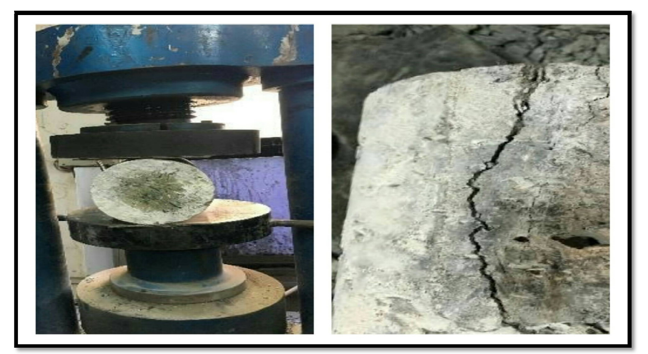
Figure: 3 Split tensile Cylinder test

There is no method by means of which tensile strength is determined directly. Indirect test of splitting a cylindrical specimen along diagonal compressive load is used. This test gives more uniform result. The strength determined in splitting tests is believed to be closer to the true tensile strength ranges [approximately] from 50 to 75 percent of flexural strength, with high strength concretes the ratio is relatively lower. The split tensile strength of cylinder for 28 day and 56day is shown in table. At the end of 28 day split tensile strength is decreased from 3.967 to 3.655 and 0.92% and at end of 56 day it is increased from 3.7197 to 3.739 and 0.99% increased.