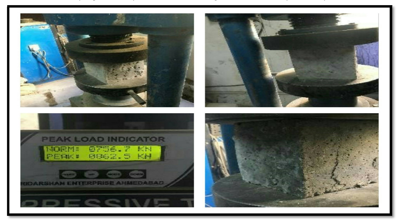
Figure:2 Compressive strength of cubes

Test is done with nominal concrete and 50% replacement of recycled aggregate concrete for compressive strength for cubes 3, 28 and 56 days, split tensile cylinder and flexural strength for beams at 28 day and 56 day.