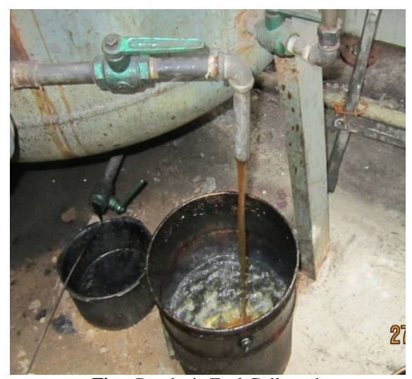
Fig:- Pyrolysis Fuel Collected

Plastic is not easily decomposable its affect in fertilization ,atmosphere ,mainly affect on ozone layer so it is necessary to recycle these waste plastic into useful things. The Agricultural waste is a large component of bio-degradable waste and it occupies large landfill area so an attempt has been given to use waste in total as a source of fuel.