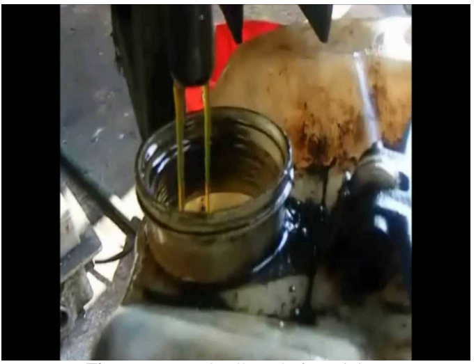
Fig:- Waste Fuel collected after mixing