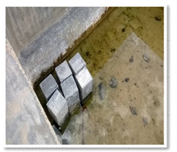
Fig.5 curing of specimen

After the concrete has attained the sufficient setting, they are removed from the Mould and the same is placed in the curing tank for curing process for 28 days