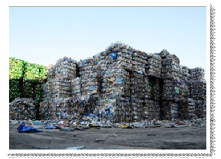
Fig.1 synthetic (plastic) wastes

Additionally, we consider another one criteria, that, the hollow sections are the most versatile and efficient form of construction and mechanical applications. Many of the strongest and most imposing structures in the world today would not have been possible without hollow sections.