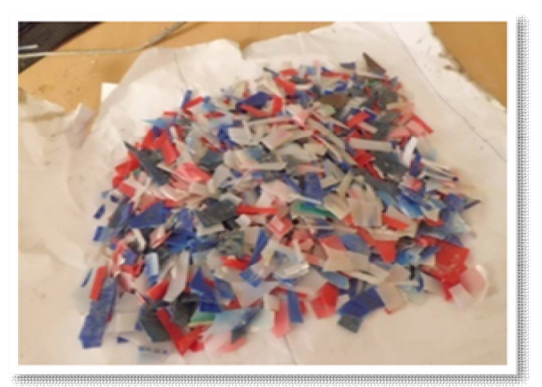
Fig.2 SQF (prepared by us from synthetic squanders)

This figure illustrates the samples of Synthetic (plastic ) wastes which are available at the site located nearer to Pudukkottai Sipcot plastic industry and the same is collected for the research along with domestic wastes from pudukkotai municipality