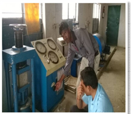
Fig.6 Test on a compression testing machine

After the concrete has attained the sufficient setting, they are removed from the Mould and the same is placed in the curing tank for curing process for 28 days