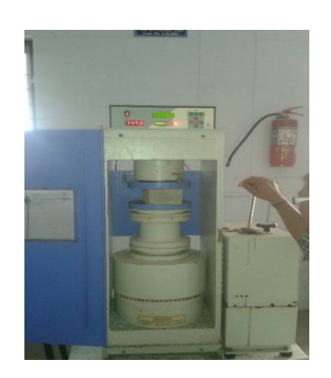
Figure 4: experimental set up for compressive strength test

The compression testing machine is used for testing the compressive strength of bricks. After the curing period of 7days and 21days gets over bricks are kept for testing. To test the specimens the bricks are placed in the calibrated Compression testing machine of capacity 2000 kN applied a load uniform at the rate of 2.0 kN/min. The load at failure is the maximum load at which specimen fails to produce any further increase in the indicator reading on the testing machine. In that five numbers of bricks were tested for each mix proportion. Each brick may give different strength. Hence, average of five bricks was taken.