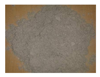
Figure 3: Fly Ash content