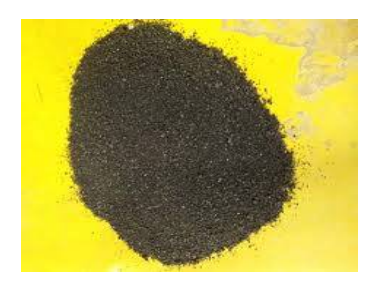
Figure 2: Copper Slag content