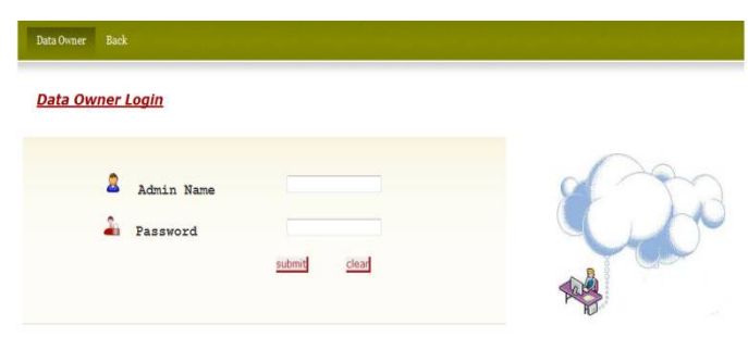
Figure 4: Data Owner Login Page

A home page or index page is the initial page of a website. Home page includes the option home ,dataowner and user from that the further pages will be operated.