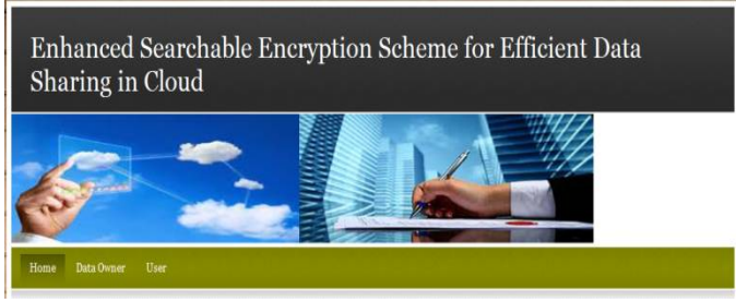
Figure 3: Home Page

The proposed system is implemented on eclipse. Here data owner can upload single file or multiple files. When uploading files to cloud an SSE key will be generated. Based on SSE key user can download the number of files as shown in below Figures. Generation of SSE key reduces the time consumption and improves the access performance.