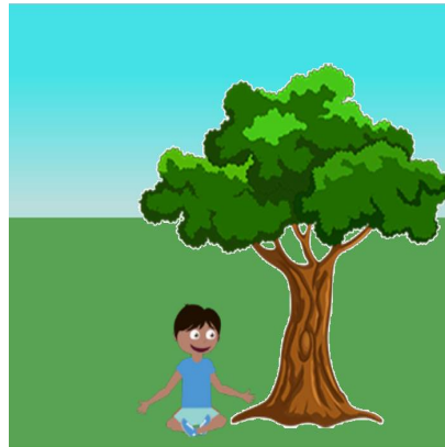
Fig. 5: Output scene generated for the sentence “A boy is sitting under the tree”

The semantic elements extracted from the previous step are converted into corresponding visual representation. The scene generation relies on the database which contains a number of images and location information for various relations. If the noun present in the input sentence is a human being, the database provides different poses and facial expressions too. Database for the system is created with the help of abstract scene data set provided by [12]. Image corresponding to the subject and object are searched in the database and those with higher probability are retrieved. Scene is generated by positioning the retrieved images according to the location information. Figure 5 gives the output scene generated for the given sentence “The boy is sitting under the tree”.