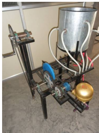
Figure 2 : Actual setup

There is a handle connected to the sprocket which transmits its rotary motion to the free wheel via chain. A spur gear G2 is mounted on the other end of the shaft of the free wheel which transmits power to two pinions G1 and G3 on either side. Pinion G1 transmits power to the pulley which drives the reciprocating pump P, which in turn sucks water from the reservoir and pumps it to the drum. Pinion G3, flywheel and square jaw clutch are mounted on the same shaft left to right. The other half of the clutch and bevel gear are mounted on the adjacent shaft. The bevel pinion G5 then drives a plate inside the vertical drum.