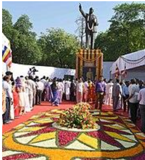
The statue of B. R. Ambedkar in the Parliament of India

In 1930, Ambedkar launched the Kalaram Temple movement after three months of preparation. About 15,000 volunteers assembled at Kalaram Temple satyagraha making one of the greatest processions of Nashik. The procession was headed by a military band and a batch of scouts; women and men walked with discipline, order and determination to see the god for the first time. When they reached the gates, the gates were closed by Brahmin authorities.