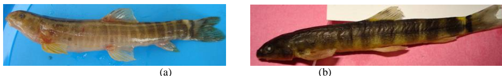
Figure 1 Nemacheilus montana collected from (a) Khanda stream and (b) Saung stream

The sampling locations included Khanda (S1) and Saung (S2) (Fig. 2). Altogether fifty two specimens were collected for detail morphometrics (Table 1). For the molecular analysis, the muscle tissues were dissected from thirty seven specimens and preserved in a 95% ethanol.